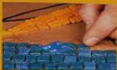
FILLING THE PATTERN