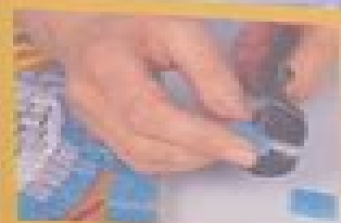
CUTTING THE TILES