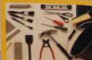
TOOLS AND EQUIPMENT