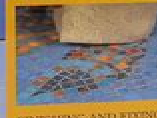
FINISHING AND FIXING