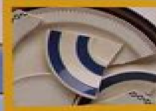
MAKING MOSAIC PIECES