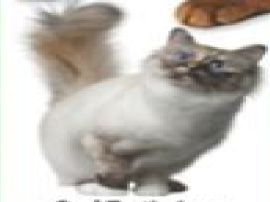
Seal Tortie Lynx Point Birman

Abyssinian Having a similar appearance with the cats of ancient Egypt, it is believed to be one of the oldest domesticated breeds.