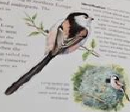
Long-tailed tit feeding large nest with a hole

The tail feathers of these tits can account for nearly half their total length. These birds occurring in southern Europe have a completely white head and underparts. The Turkish race (A. t. trichas ) has a black cap and a black breast. The plumage is mostly black, including a bill, with a white streaking on its cheeks. Long-tailed tits are lively birds, usually seen in small parties, and frequently in the company of other tits. They are often seen in the mountains during the winter, when the warblers are without leaves. Long-tailed tits will roost together, which helps to conserve their body heat — sometimes as many as 10 birds may be clustered together. Long-tailed tits can be quite noisy when feeding during the day. Their feeding period starts early, in February, and may extend through until June.