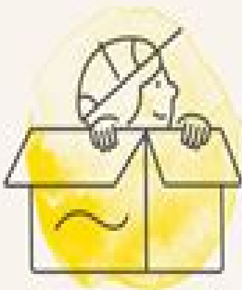
Playing in a box