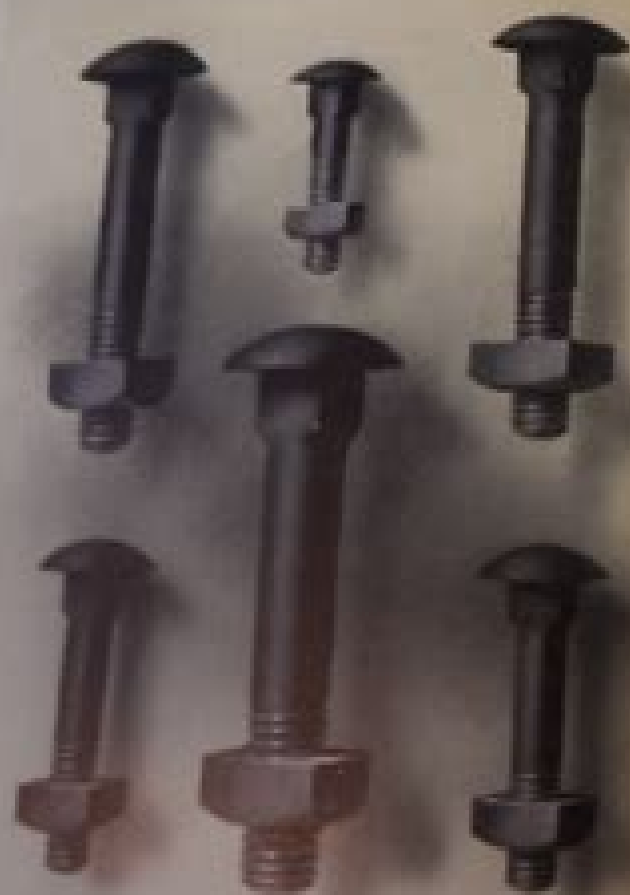
ENTIRE CARRIAGE BOLTS

various machines, and then for a time they manufactured wood screws, calling themselves the Union Screw Company. Another concern, however, obtained a patent on a gimlet-pointed screw and took the wind from their sails.