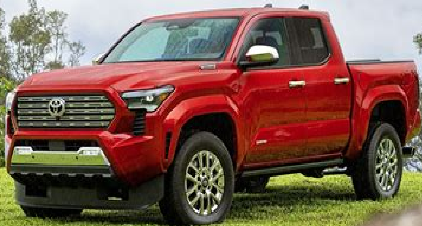
2024 Toyota Tacoma shown