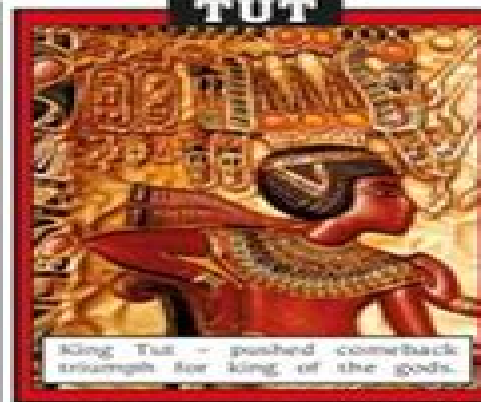
King Tut - pushed comeback triumph for king of the gods.

Tut Tut, 9, announced the togethery turn-around after high-level discussions with palace advisors. "Amun is now top god again, and his shrines and statues will be making a