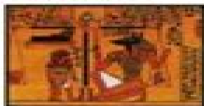
Bakenshah in the underworld, yesterday.

Tomb boxes were unavailable for comment.