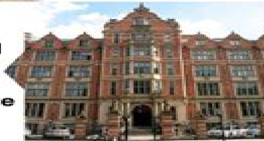
University of Edinburgh