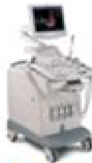
Ultra sound machine