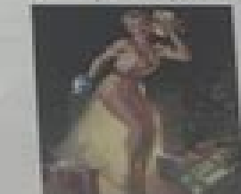
Red and White Swimsuit Model 1950, Gil Elvgren, Pin-up Art

December | December | Décembre | December | 12/01