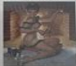
Red and White 1950, Gil Elvgren, Pin-up Art

November | November | Novembre | November | 11/01