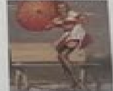
Red and White Swimsuit 1950, Gil Elvgren, Pin-up Art