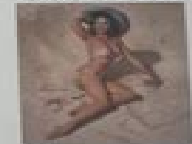
Red and White 1950, Gil Elvgren, Pin-up Art

September | September | Septembre | Szeptember | 9/01