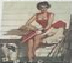
Red and White Swimsuit Model 1950, Gil Elvgren, Pin-up Art