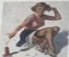
Looking for Trouble 1950, Gil Elvgren, Pin-up Art

January | Januar | Janvier | Január | 1/01