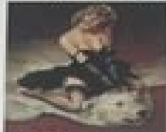
Black and White Swimsuit Model 1950, Gil Elvgren, Pin-up Art

February | Februar | Février | Február | 2/01