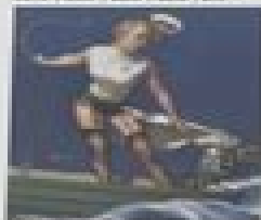
A Red Swimsuit in a Black Swimsuit 1950, Gil Elvgren, Pin-up Art