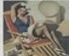
Blue and White 1950, Gil Elvgren, Pin-up Art