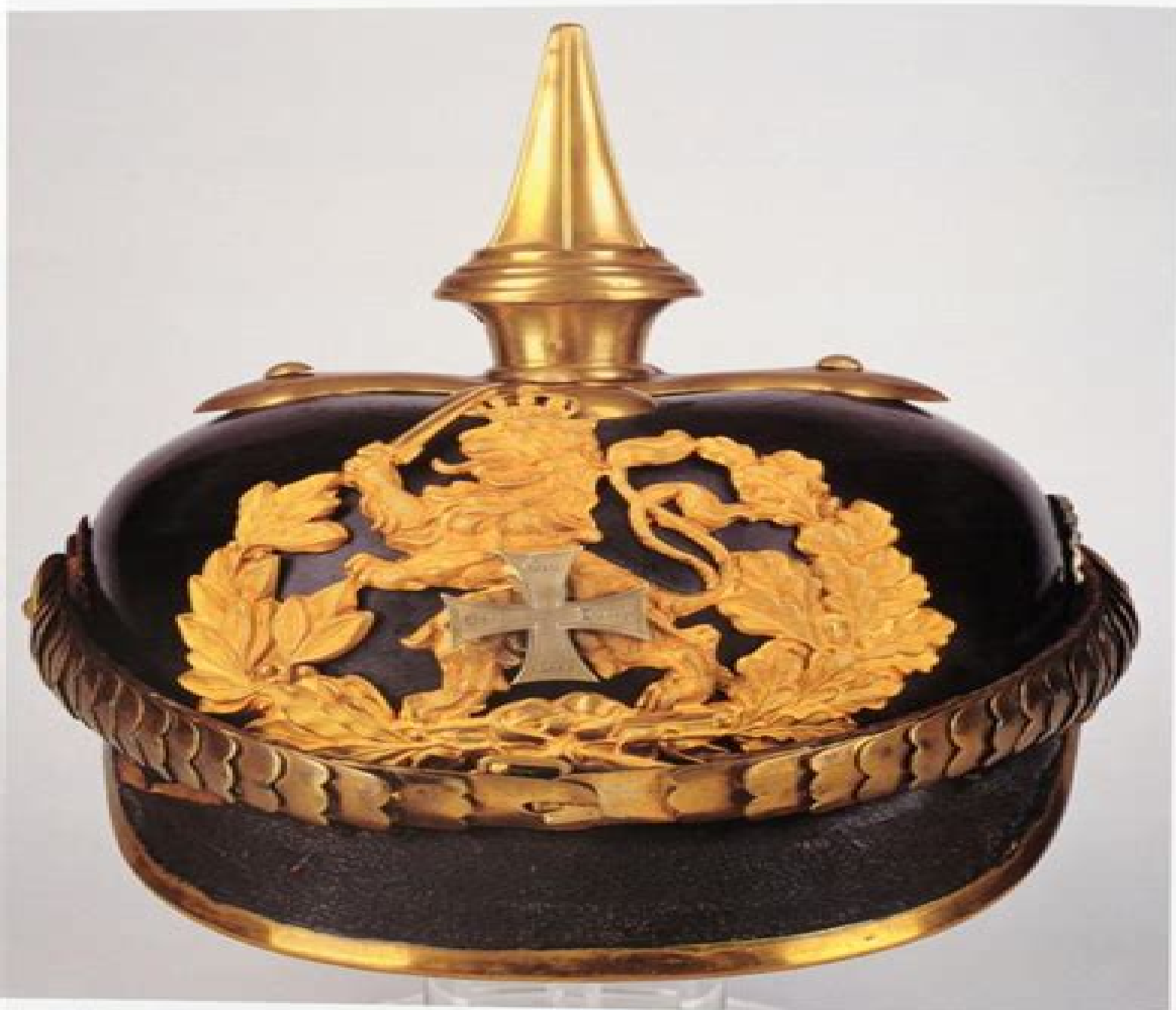
Hessian 118th Infantry Officer's kepi (Infanterie-Regiment Prinz Carl (4. Großherzoglich Hessisches) Nr. 118)