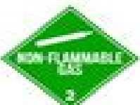
Subclass 2.2: Non-Flammable Gas