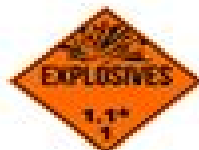
Subclass 1.1: Explosives with a mass explosion hazard