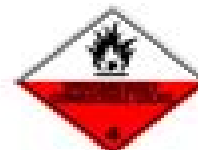
Subclass 4.2: Spontaneously combustible solids