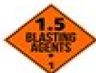
Subclass 1.5: An insensitive substance with a mass explosion hazard