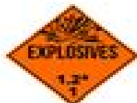
Subclass 1.2: Explosives with a severe projection hazard