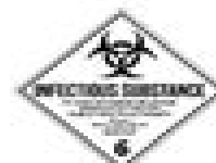
Subclass 6.2: Biohazard