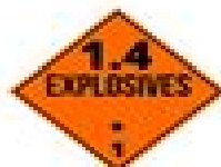
Subclass 1.4: Minor fire or projection hazard