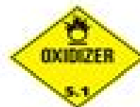
Subclass 5.1: Oxidizing agent