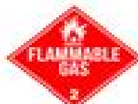
Subclass 2.1: Flammable Gas