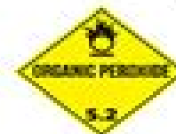
Subclass 5.2: Organic peroxide oxidizing agent