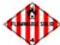
Subclass 4.1: Flammable solids