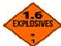
Subclass 1.6: Extremely insensitive articles