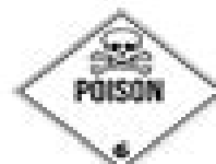
Subclass 6.1: Poison