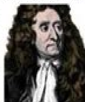
La Fontaine (1621 - 1695)