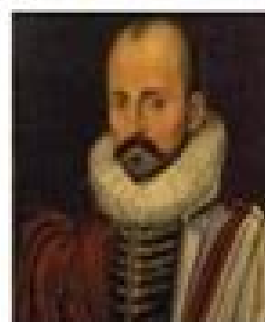
Montaigne (1533 - 1592)