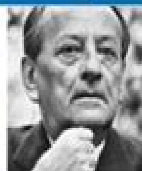
Malraux (1901 - 1976)