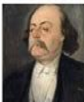
Flaubert (1821 - 1880)