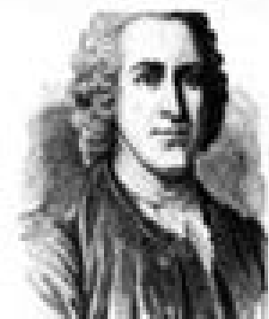
Rousseau (1712 - 1778)