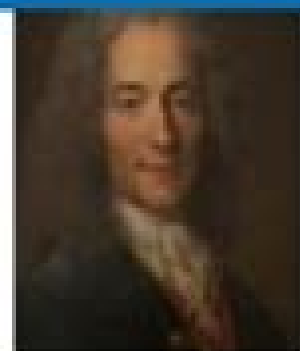
Voltaire (1689 - 1778)