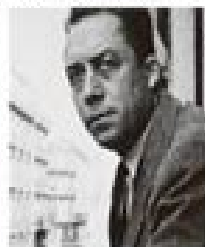
Camus (1913 - 1960)