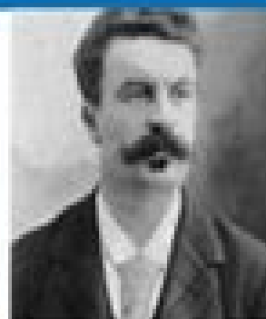
Maupassant (1850 - 1893)