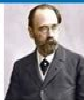
Zola (1840 - 1902)