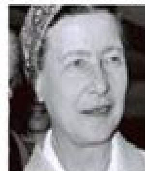
S. de Beauvoir (1908-1986)