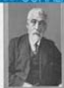
Dumas (1802 - 1870)