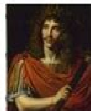
Molière (1622 - 1673)