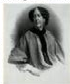
G. Sand (1804-1876)