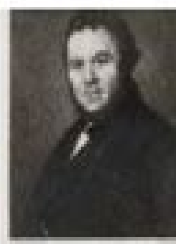
Stendhal (1783 - 1842)