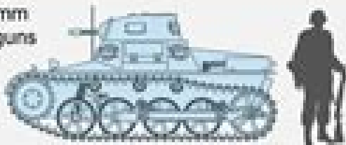
Pz. I Ausf. A

37-mm gun (later 50-mm) 7.92-mm coaxial machine gun 7.92-mm bow machine gun