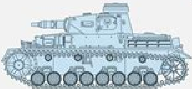
Pz. IV Ausf. D

75-mm gun (later a long-barrel 75-mm) 7.92-mm coaxial machine gun 7.92-mm bow machine gun