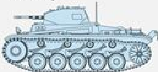
Pz. II Ausf. F