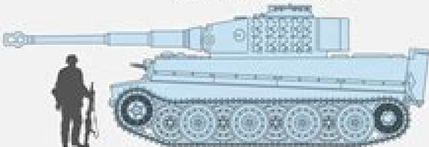
Pz. VI Tiger I Ausf. E

88-mm gun 7.92-mm coaxial machine gun 7.92-mm bow machine gun