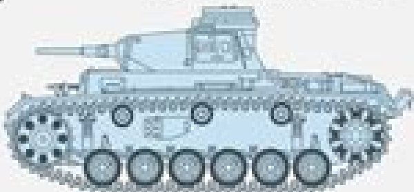
Pz. III Ausf. F

37-mm gun (later 50-mm) 7.92-mm coaxial machine gun 7.92-mm bow machine gun