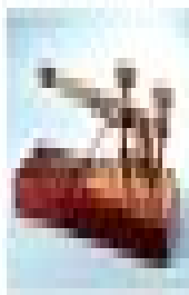
Samuel Morse invents the Telegraph