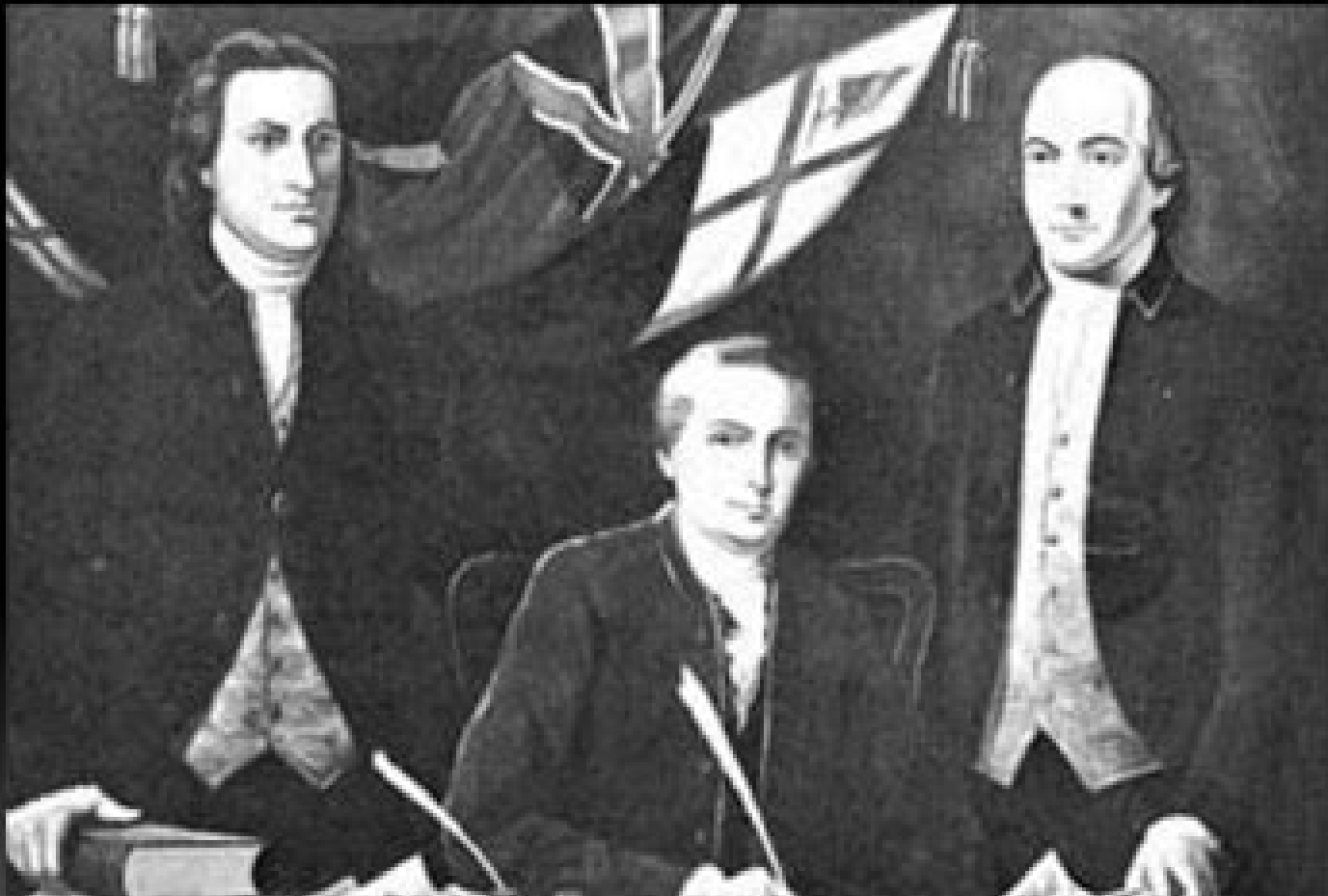
Button Gwinnett *** George Walton *** Lyman Hall