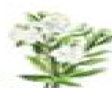
MYRTLE Love, Marriage symbol of marriage