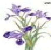
IRIS True-love lies written in flowers, my compliments, Truly, hope, Your friendship means a lot written