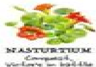
NASTURTIUM Cress-like, waxing in love-life