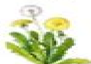
DANDELION Trustfulness, Happiness