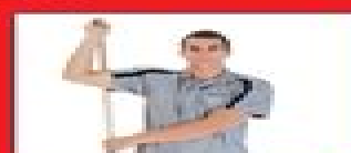
Shoulder Stretch: Stand with your feet shoulder-width apart, lean forward, and pull your right arm across your chest to the left.