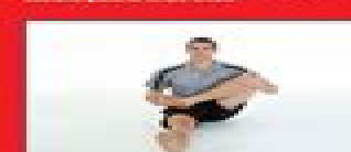
Side Body Stretch: Sit on the floor, lean to the right, and pull your right arm across your chest to the left.