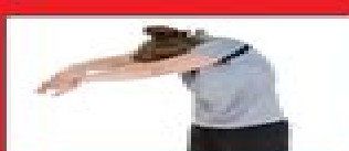
Shoulder Stretch: Stand with your feet shoulder-width apart, lean forward, and pull your right arm across your chest to the left.