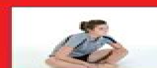
Shoulder Stretch: Sit on the floor, lean forward, and pull your right arm across your chest to the left.