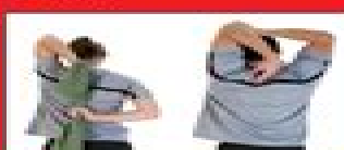
Chest Stretch: Stand with your back to a partner, reach your right arm over your head and to the left, and your partner pulls it down.