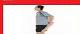
Neck Stretch: Stand with your feet shoulder-width apart, lean your head to the right, and pull your right ear towards your right shoulder.