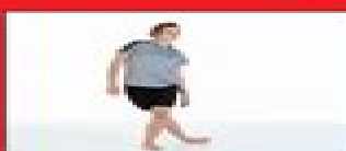
Shoulder Stretch: Stand with your feet shoulder-width apart, lean forward, and pull your right arm across your chest to the left.