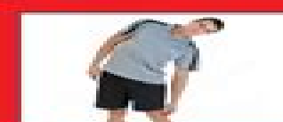
Side Body Stretch: Stand with your feet shoulder-width apart, lean to the right, and pull your right arm across your chest to the left.