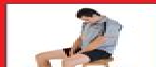
Side Body Stretch: Sit on a chair, lean forward, and pull your right arm across your chest to the left.