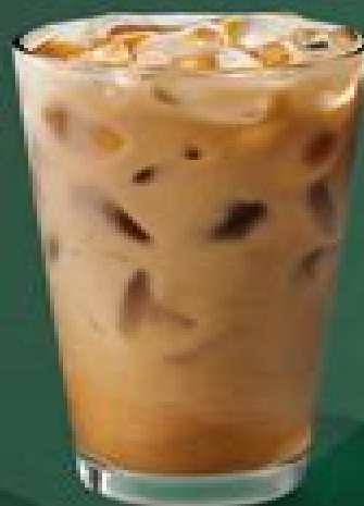
SEPTEMBER 16 Iced Vanilla White Chocolate Mocha Americano