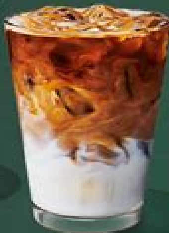
SEPTEMBER 9 Iced Double Caramel Macchiato