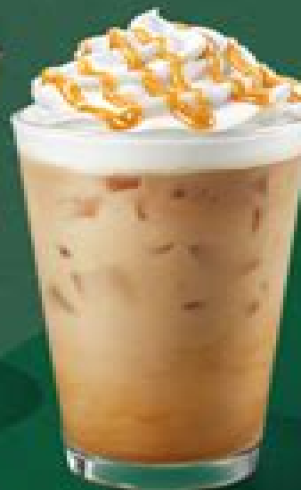
SEPTEMBER 23 Iced Salted Caramel Latte