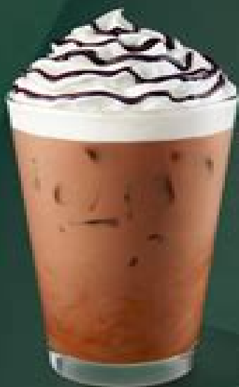
SEPTEMBER 2 Iced Duo Mocha

Enjoy these new-to-love Iced beverages at ₱120 this September.