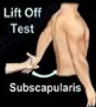
Lift Off Test