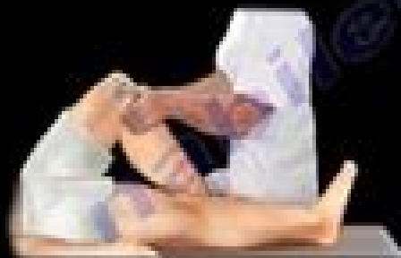
Posterior Drawer Test