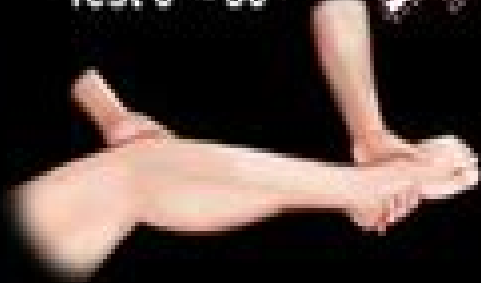
Valgus Stress Test 0° - 30°