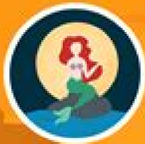
The Little Mermaid