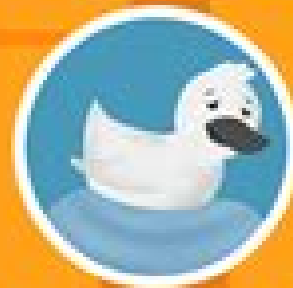
The Ugly Duckling