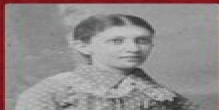
Martha Bernays. Wife

Una novela histórica sobre la relación entre Sigmund Freud y sus mujeres