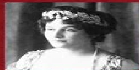
Marie Bonaparte. Colleague