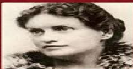
Lou Andrea Salomé. Colleague