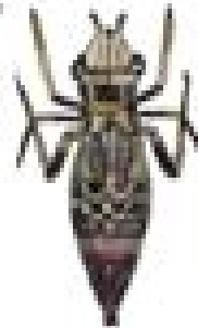
Dragonfly Larva (Zygoptera: Libellulidae) 20-30mm