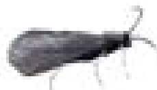
Little Black Caddisfly (Trichoptera: Hydropsychidae) 2-10mm