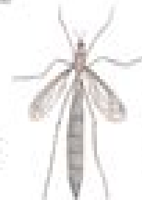
Caddisfly Adult (Diptera: Tipulidae) 10-20mm