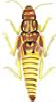
Common Stonefly (Plecoptera: Perlodidae) 10-20mm