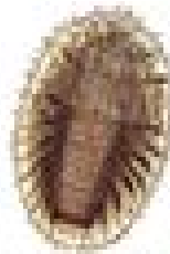
Water Penny Beetle (Zygoptera: Psephenidae) 1-2mm