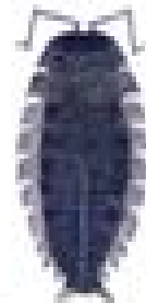
Aquatic New Bug (Dermaptera: Notostomatidae) 1-2mm