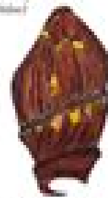
Gilled Snail (Gastropoda: Planorbidae) 4-10mm