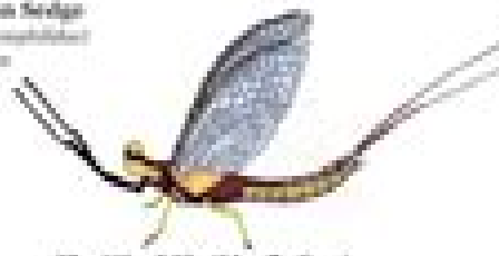
The "Blow" Fly (Mayfly Doe) (Ephemeroptera: Ephemerellidae) 10-20mm