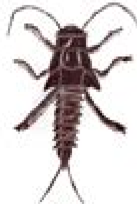
Giant Stonefly (Plecoptera: Perlodidae) 20-30mm