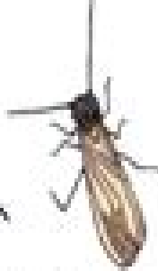
Noddy (Yellow Stonefly) (Plecoptera: Chloroperlidae) 2-10mm