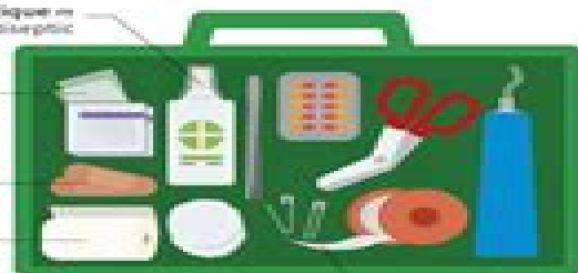
le ruban adhésif adhesive tape