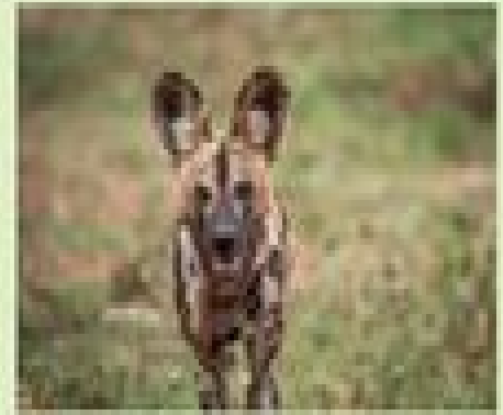
African Wild Dog