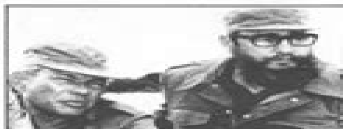
En la portada, Un grano de maíz de Tomás Borge

El 1 de junio de 1992 con Los cerros son espaldas, fundación literaria de la que es presidente y a la cual ha entregado todos sus derechos morales. Esta organización está dedicada a la ayuda de niños abandonados y en situación de riesgo y cubren a decenas de miles de infantes.