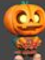
05 C. CARRASCO