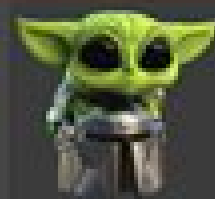
06 BABY YODA / DROOD