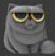
04 GRUMPY CAT