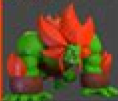
01 BLAND A