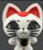
09 TURBO GRUMPY