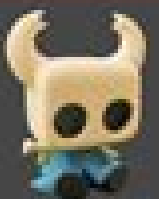
07 HOLLOW KNIGHT