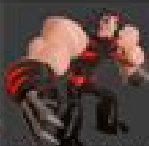
03 WEAPON B APOCALYPSE