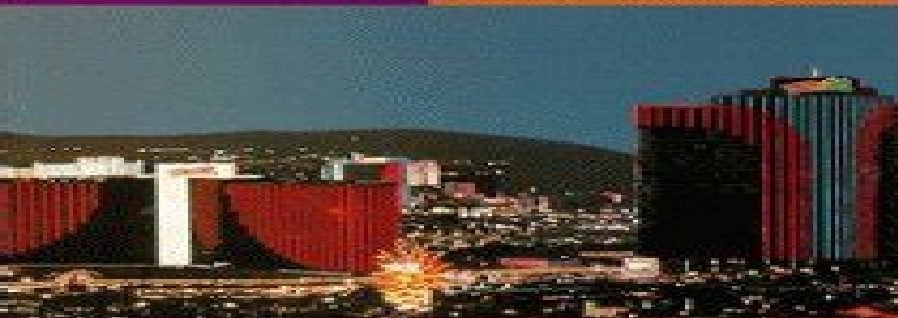
© 1999 New York-New York Hotel & Casino

The only guide that saves you hundreds of dollars and helps you get the most out of your trip