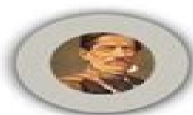
RAMÓN CASTILLA 1845-1851/1855-1862