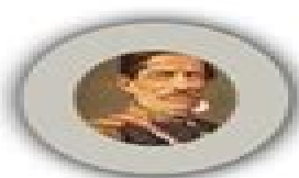
JUAN PEZET 1863-1865