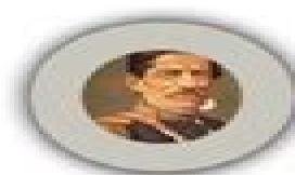
JOSÉ BALTA 1868-1872