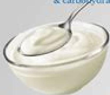
Fat-free Milk and Yogurt Calcium & vitamin D