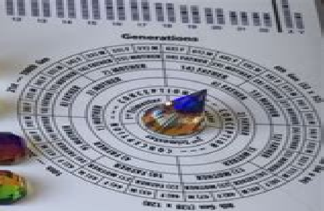
Structure of the Chakras