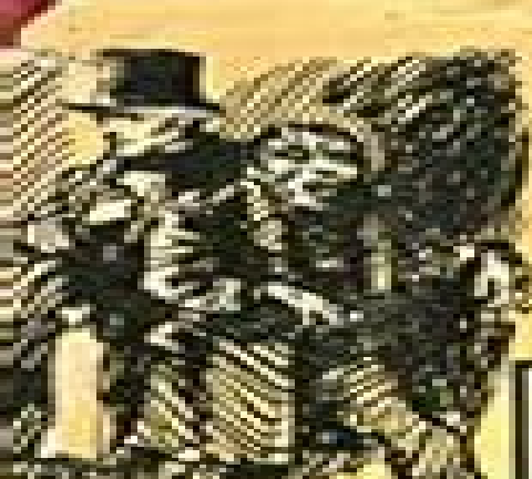
JEKYLL & HYDE