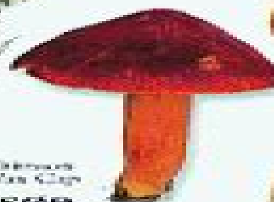
Crimson Wax Cap