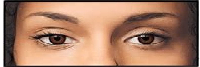
Portion of muscle removed