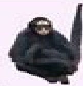
White-Cheeked Spider Monkey