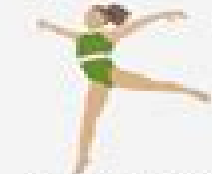
Floor exercise, women