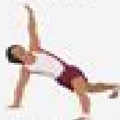
Floor exercise, men