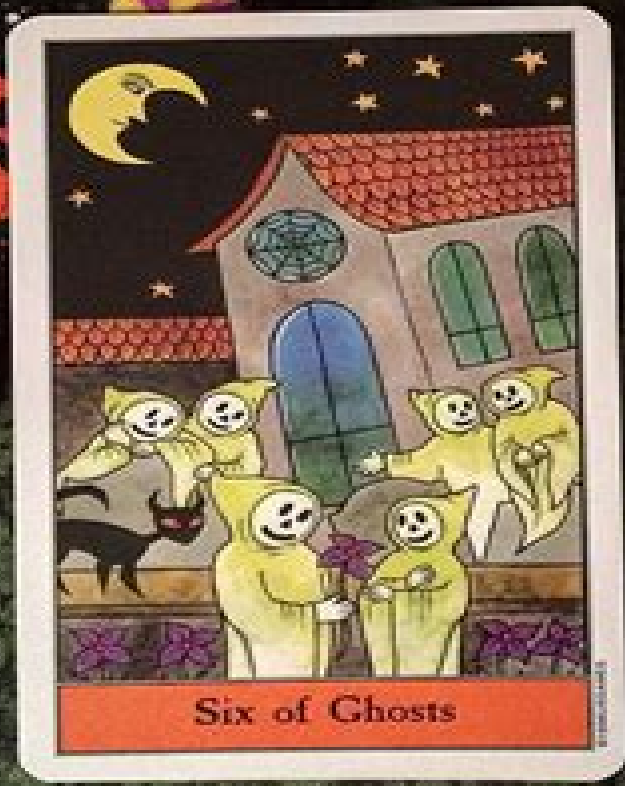
Six of Ghosts