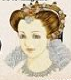
middle 1570s, France