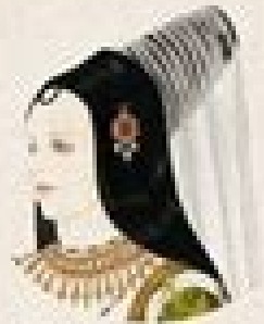
late 1470s, Burgundy