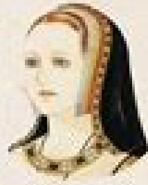
early 1500s, France