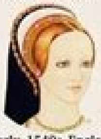
early 1540s, England