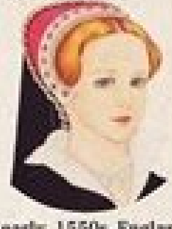
early 1550s, England