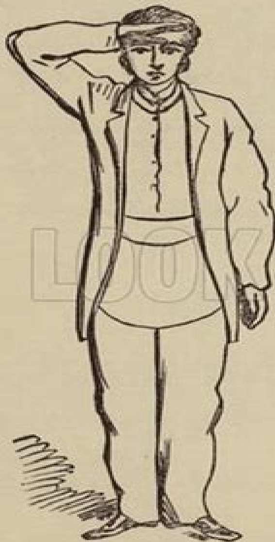
ROYAL ARCH DUEGARD AND SIGN.