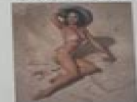
Swimsuit Model 1950, Gil Elvgren, Pin-up Art

August | August | Août | Augustus | 8/01