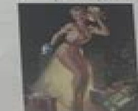
Swimsuit Model 1950, Gil Elvgren, Pin-up Art

December | December | Disember | Decembru | 12/01