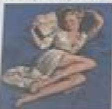
Swimsuit Model 1950, Gil Elvgren, Pin-up Art

October | Oktober | Octobre | Oktobru | 10/01