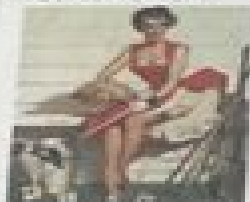
Swimsuit Model 1950, Gil Elvgren, Pin-up Art