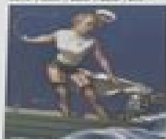
A Pin-Up Girl in a Swimsuit 1950, Gil Elvgren, Pin-up Art