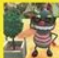
Scene 5 The garden gate