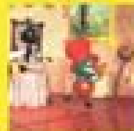
Scene 6 The garden gate