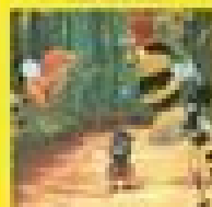
Scene 2 A little boy's house