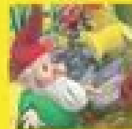
Scene 7 The garden gate

Based upon characters created by Antoon Krings Published in Gullmand Jeunesse/Gilboudes Editions © 1996 GULLMAND JEUNESSE