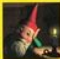
Scene 4 The garden gate