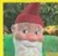
Scene 3 The garden gate