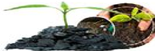
Plant nutrition application (organic fertilizer and biochar)