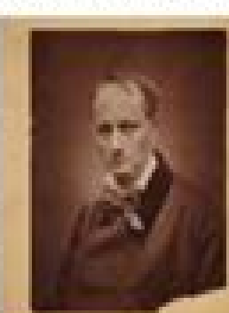
Baudelaire (1821 - 1867)