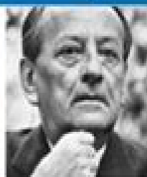
Malraux (1901 - 1976)