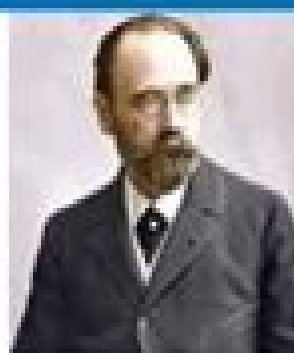
Zola (1840 - 1902)