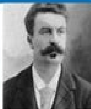
Maupassant (1850 - 1893)