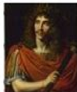
Molière (1622 - 1673)