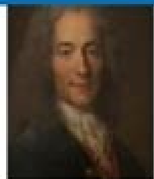
Voltaire (1689 - 1778)