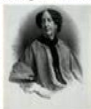
G. Sand (1804-1876)