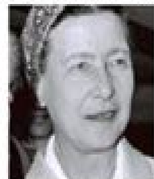
S. de Beauvoir (1908-1986)