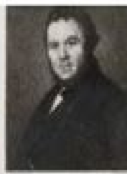
Stendhal (1783 - 1842)