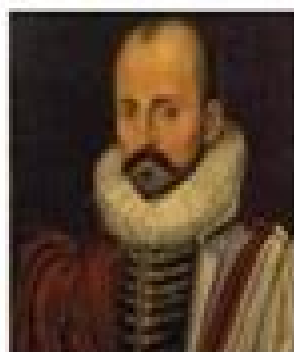
Montaigne (1533 - 1592)