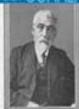
Dumas (1802 - 1870)