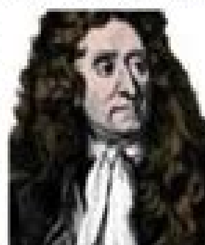
La Fontaine (1621 - 1695)