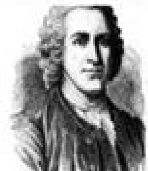
Rousseau (1712 - 1778)