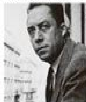
Camus (1913 - 1960)