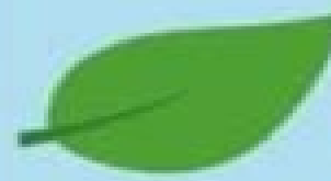
leaf la feuille