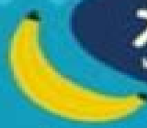
banana la banane