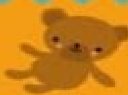
teddy le nounours