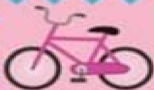
bicycle le vélo