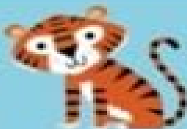
tiger le tigre