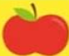
apple la pomme