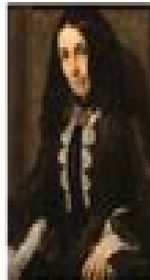
Elizabeth Barrett Browning