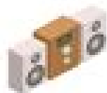
Surround sound system