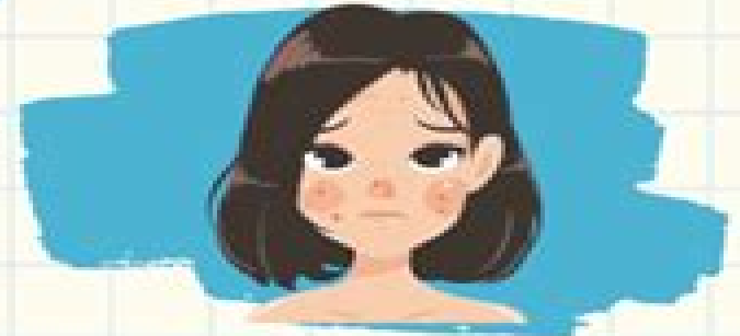
PROBLEMAS DE PIEL