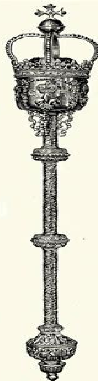
MACES, STAMFORD Temp. Charles II. Art Journal.