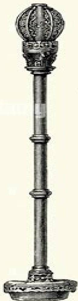
MACE, SOUTHAMPTON. Temp. Henry VII.