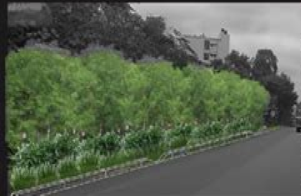
PROPOSED EDGE RAIN GARDEN (DRAWN BY AUTHOR)

PLANT PALETTE : LIST OF PLANTS PROPOSED WITH SPECIFICATION: