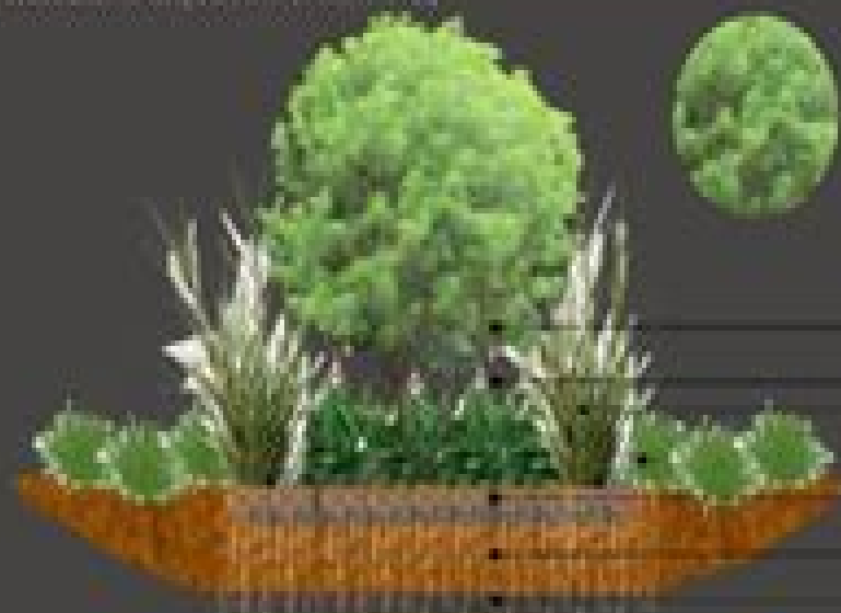
PLANT PALETTE : EDGE RAIN GARDEN (DRAWN BY AUTHOR)